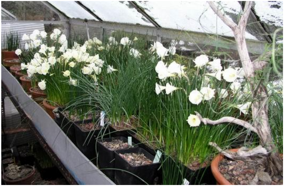
Bulb house December 2003

There is not much work required in the Frit house at the moment, other than checking on moisture levels, but I can see the gravel rising up on many of the pots. This is a sign that they are in growth and the shoots will not be far below the surface ready to appear soon.