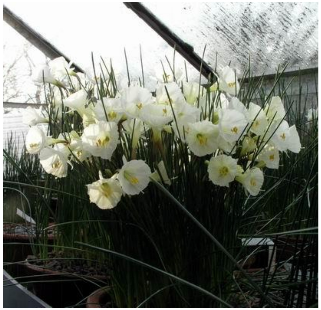
N.\ romieuxii\ mesatlanticus\\ Some\ of\ the\ pots\ of\ N.\ romieuxii\ mesatlanticus\ are\ just\ crammed\ full\ of\ flowers.