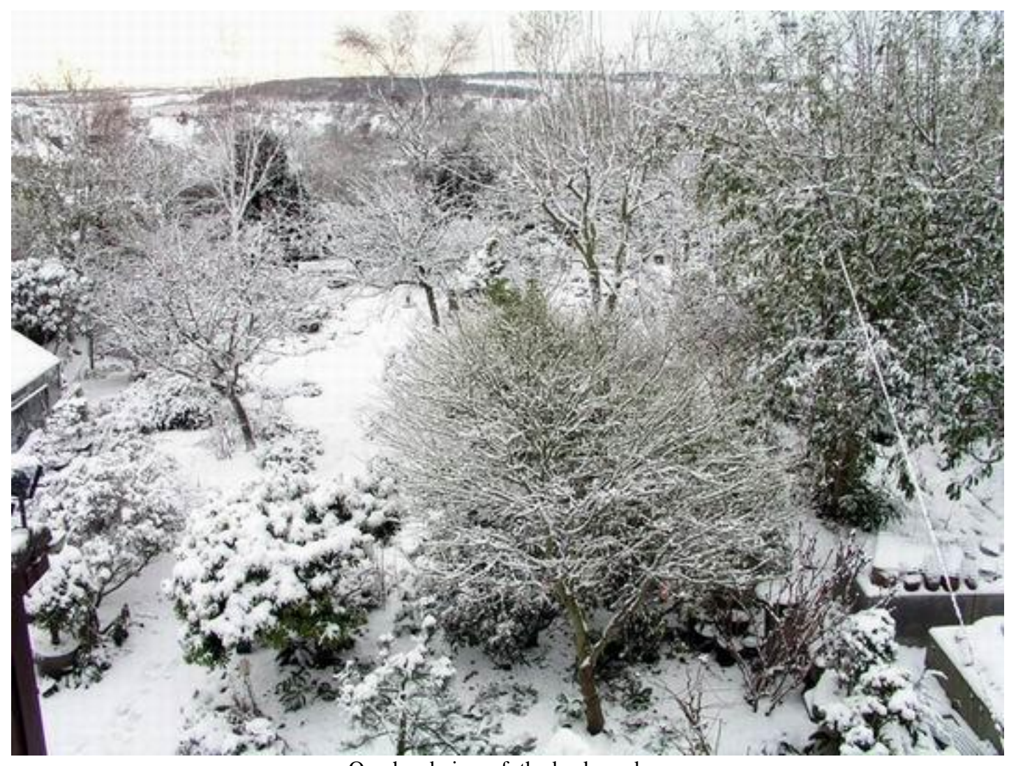
Overhead view of the back garden.

It does make the garden look pretty with all the branches and shrubs hanging with snow and it is a good time to stay indoors and catch up on reading the books , Journals, seed lists and sorting out this year's slides and digital images. I will be back next year!